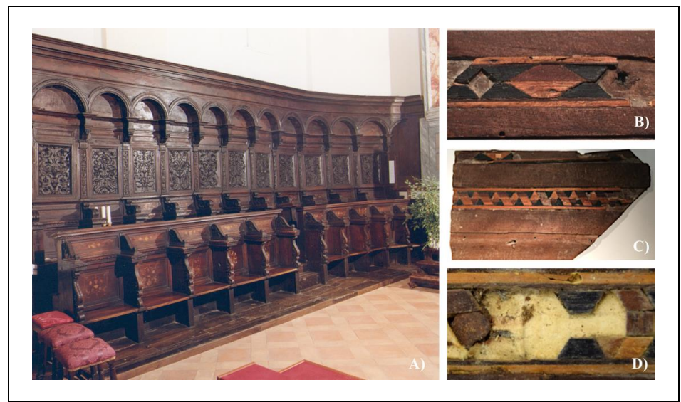
Figure 1. The wooden choir of San Rufino in Assisi: (A) Choir with bas-relief panels and pillars, (B-D) motifs realized by means of the inlaid 'a toppo' to hidden joint by nails. Note the nail and the paper layer in (D).

The choir is constituted from two orders of stalls, which were reworked over time. A radical renovation of the cathedral was planned in 1571 by the architect Galeazzo Alessi. The consolidation work changed the interior layout of the cathedral, and probably also affected the choir. In the nineteenth century the changes also affected the central area of the apse to house the great organ of 1841 by Antonio and Francesco Martinelli from Umbertide [G. Elisei, Accademia Propertiana del Subasio, I, 1895, 50-52]. In 1846 the high altar was replaced and shortly afterwards in the presbytery area four doors were opened in the niches of the dome, eliminating the corresponding altars [1].