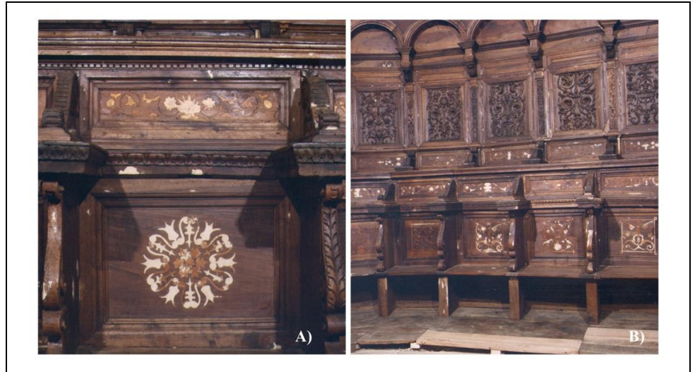
Figure 3. (A) Grouting in the decorated parts of the inlays and in the frames, (B) the choir during restoration.

The rehabilitation operations on the disassembled parts were conducted more easily. In the fissures of the panels walnut wedges were introduced from the rear, the same species as the original one. To restore the functionality of the folding seats, the addition that raised the seats was removed. The missing frames were reconstructed according to the existing modules (Figure 3A). In the reconstruction operation the two wooden panels connecting the organ were not reintegrated, in order to highlight the modification made on the choir over the past centuries. After cleaning, the consolidation of the elements most degraded by xylophagous insects was carried out by impregnation with acrylic resin in a 7% solution (Paraloid B72 in nitro diluent); the disinfestation was operated with Permetar applied by brushing on the front and by spraying on the surfaces difficult to reach. The grouting (Figure 3B) was carried out in the most degraded areas with wood pulp and finished with a plaster stucco and rabbit glue in the decorated parts of the inlays. The chromatic connection of the elements was made with natural mordant in aqueous solution, applied by glazing on the new wooden parts. The final protective treatment was applied manually with a generous spread of beeswax dissolved in turpentine and then polished with brushes and woollen cloth.